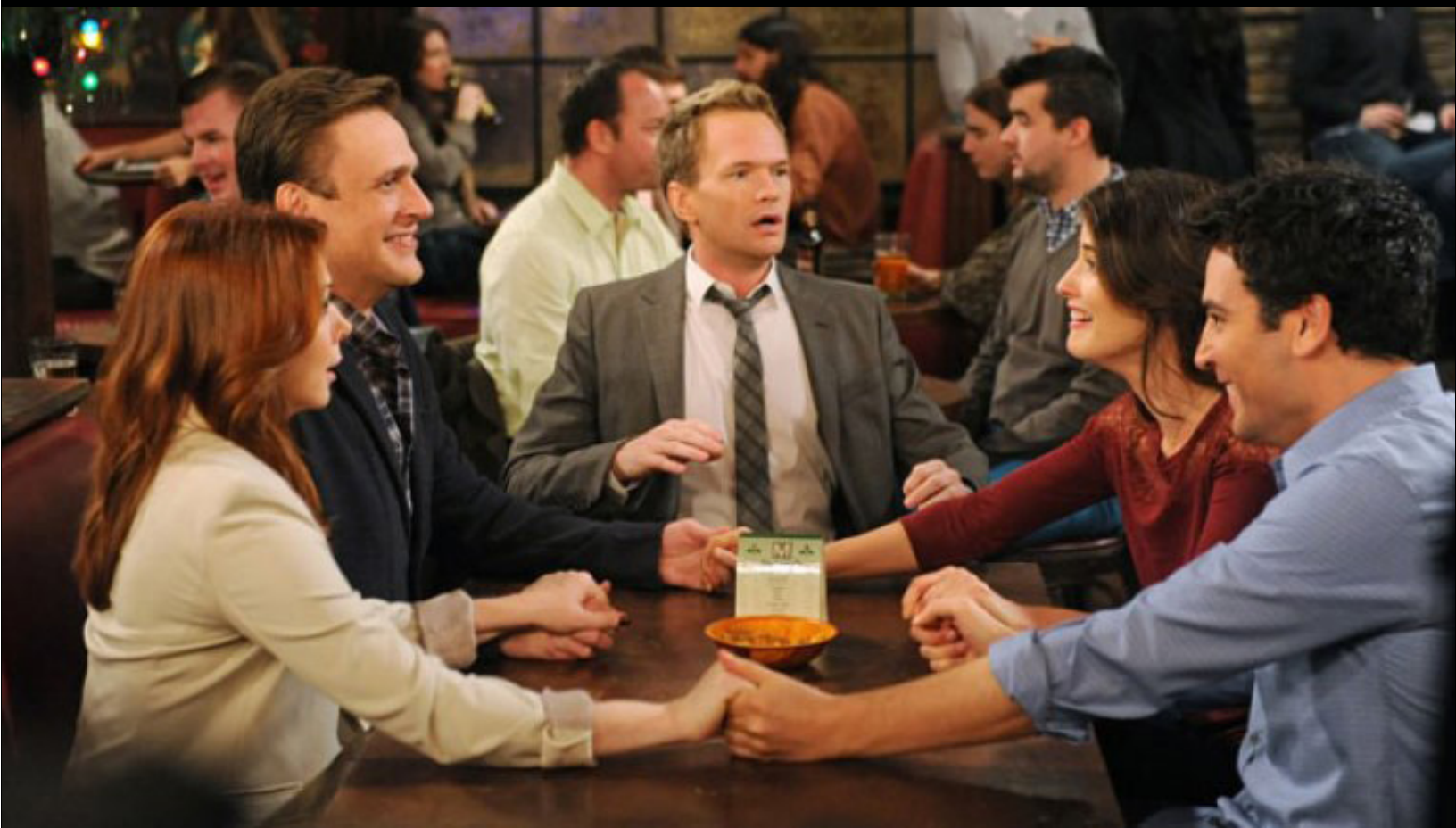
HOW I MET YOUR MOTHER | CBS

“Romantic tension that builds to a laugh and then settles into an “ahhhh, that’s sweet”.”